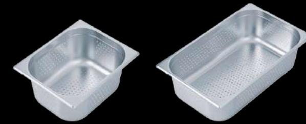
Perforated GN Pan